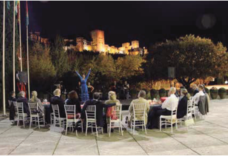
Aixa Dreams DMC & MICE y Clavel y Flamenco Performances

The Alhambra, the Generalife and the Albaicín neighbourhood are emblems of the city and a World Heritage Site, offering views of the Sierra Nevada as a backdrop. The land where Federico García Lorca was born is one of the destinations where you can step on snow and walk along the beach on the same day. Good news! In June Granada is set to become part of the AVE City Network and will be connected to Madrid with a high-speed train link.